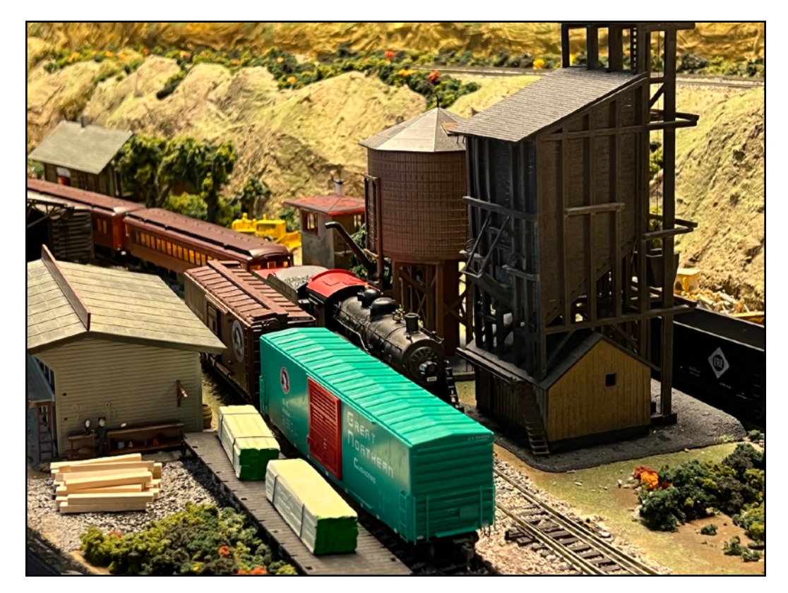
Coal tower on the HO layout (left) and the long HO bridge (below)