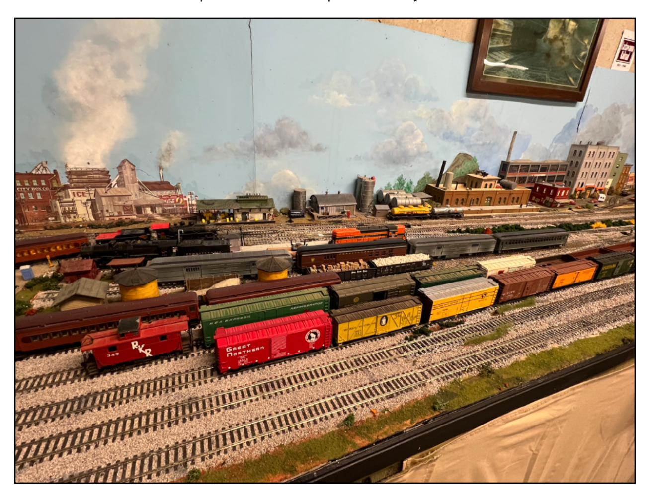
The HO yard (above) and a backdrop (left) painted by one of Leisure World's resident amateur artists.