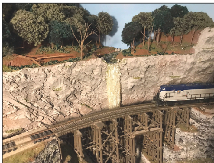
Photo left: W&V 2024 starts across the trestle with the Bear Creek waterfall in the background. This is a corner module with a forest with Bear Creek passing thru it to the waterfall.