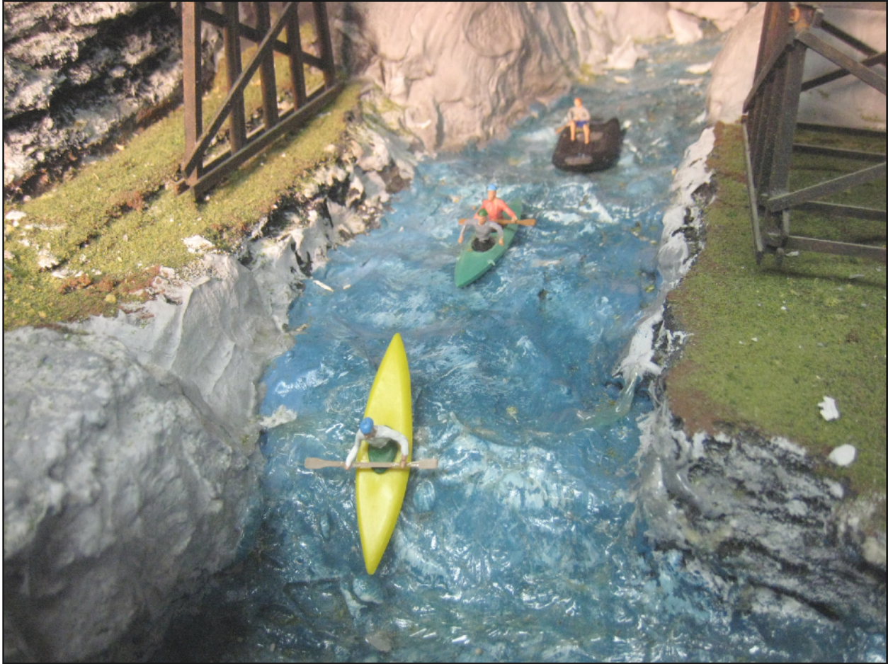
Photo above: Kayakers and a man in a white water raft are coming down a series of whitewater drop offs below the trestle along a dual mainline.