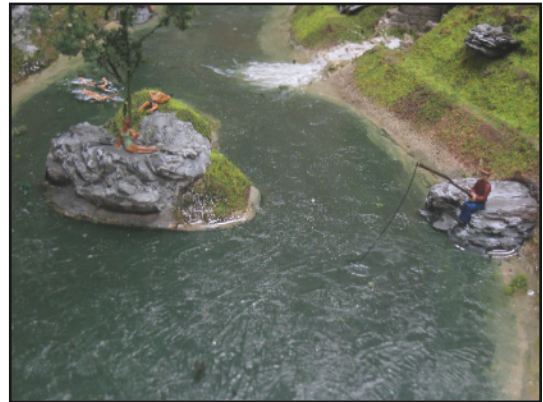
Photo above right: Fisherman are active on Lake Barbara next to an island with swimmers swimming from shore out to the island. The lake is fed by water inflow from one of two streams flowing in thru culverts. A female is sitting on the island in her bathing suit waiting for the swimmers. Ripples on the lake water were created with Woodland Scenics Water Effects over a WS Realistic Water base.

Photo left: A fisherman is fishing in Thunder Gorge adjacent to water coming down a multi-level waterfall in the gorge. The gorge walls are hand carved rock.