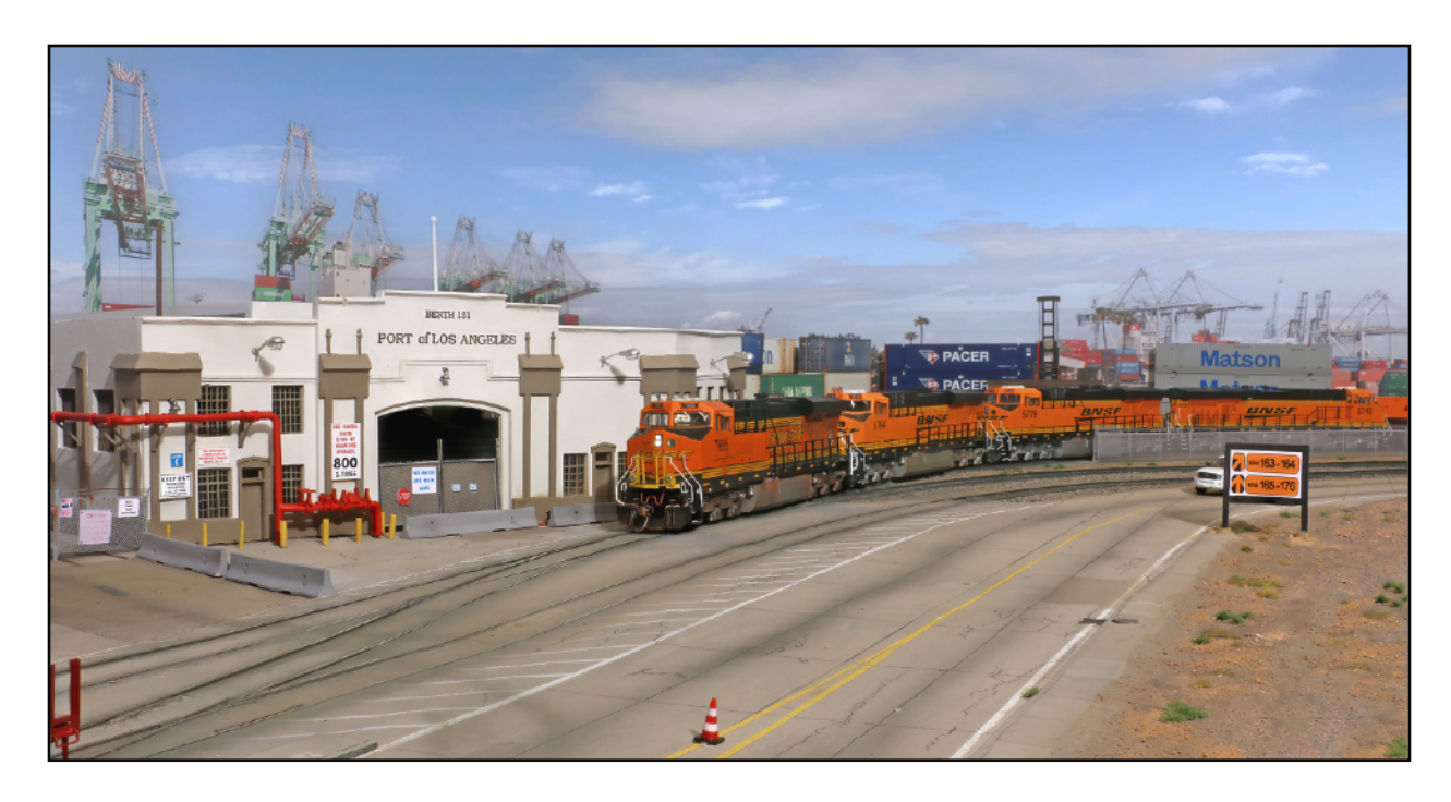
The Port of Los Angles shot (above) was from my former HO layout.