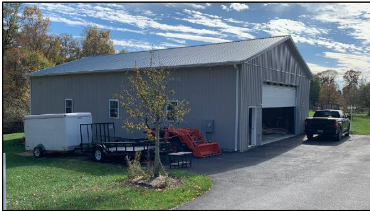
The 40 foot by 40 foot building

On Saturday, November 4, 2023, Sean Hoyden opened his "Dominion Southern" railroad as a part of the Potomac/James River Divisions Joint meet. Sean's HO scale layout is a proto-freelance, multi-level layout in a 40 ft by 40ft purpose-built room and is still under construction, and will be set in a modern era that can range from present day to as far back as the early 2000s. The staging level features three 8-track yards with a total capacity of 1500 pieces of rolling stock. The second level will represent a fictitious CSX mainline and numerous heavy industries loosely inspired by the Tidewater region of Virginia. The third level will be a more rugged and rural region similarly inspired by the Appalachian coal fields where the Dominion Southern, a regional short line. Norfolk Southern also has a modest presence on the third level. Traffic will consist of intermodal, mixed freight, unit coal, oil, auto racks/auto parts and extensive carload switching operations. The layout will support more than a dozen operators with a full CTC system and is operates using TCS DCC as well as a dispatcher.