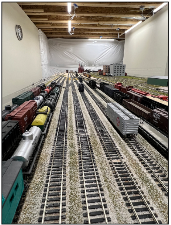
7. Do you host operating sessions or would you consider doing so? Yes, I do host operating sessions.