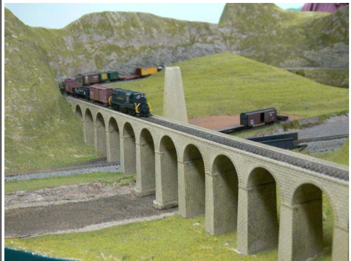
CC & CMRC

Arthur will be open on Sunday afternoon for a layout tour during the convention. Please see your convention booklet for time and directions.