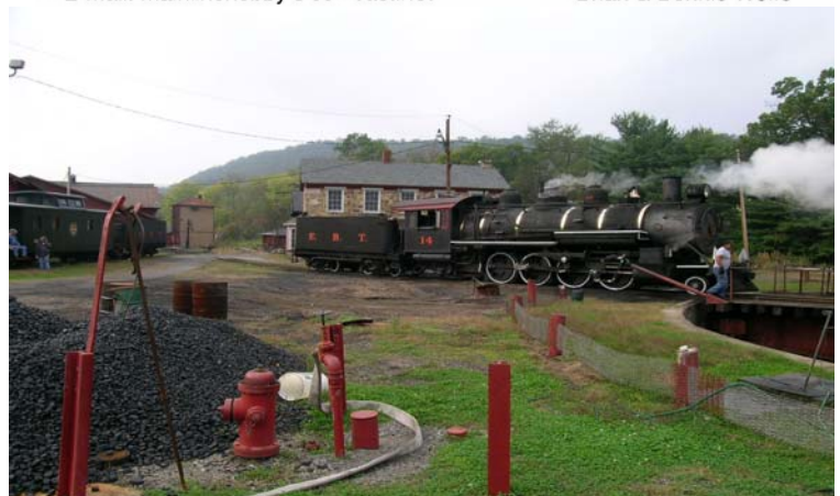
EBT # 14 for real